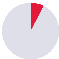
Basic rate taxpayers 7.5%