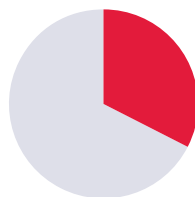
Higher rate taxpayers 32.5%